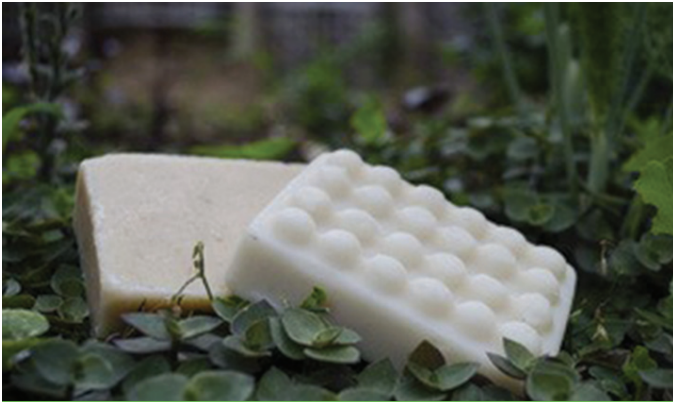
NATURAL SOAP AND SHAMPOO

Time: Flexible Duration: Approximately 1½ hour Rate: $15 per person Restrictions: 5 persons minimum