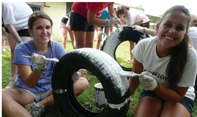
COMMUNITY SERVICE PROJECTS

Dancing is the soul of Latin America! If you have always wanted to learn Latin dancing then this is the class for you! You are going to practice styles such as Merengue, Salsa, and Cumbia Criolla. The instructors are going to show you step by step. Watch in amazement as the instructors demonstrate how to really spice up your new moves! This activity is great fun, perfect for families, friends, and groups to kick off or end a tour.