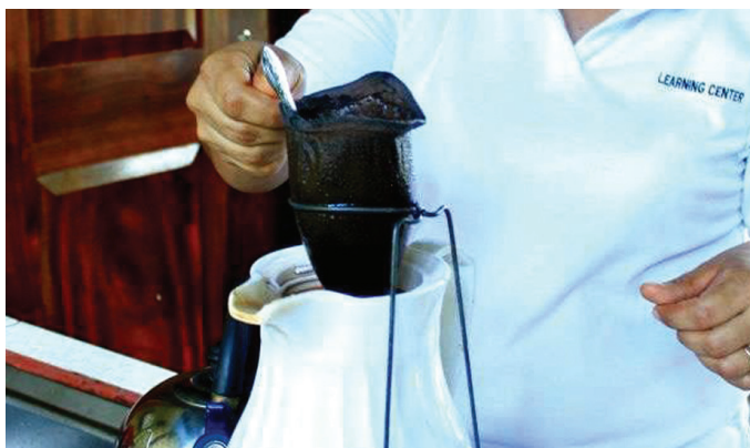
A CHAT ABOUT LIFE IN SARAPIQUI

Time: Flexible Duration: 1 hour Rate: $15 per person Restrictions: 5 persons minimum