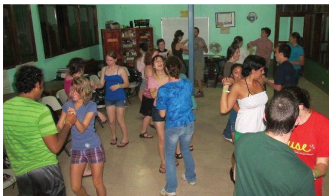
LATIN DANCE CLASS

There's no better way to learn about life in Sarapiquí than to listen and interact with a local community member! You will hear about work life in a rural environment, agricultural products in the region, family life, local arts & crafts and much more! At the end of the talk you will have the opportunity to ask questions about life here while enjoying delicious Costa Rican coffee, cheese or baked goods.