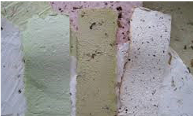
RECYCLED PAPER CHAT

Enjoy a visit with a group of local women from the Sarapiquí area who have extensive knowledge and experience in the use of medicinal plants. These knowledgeable women have decided to provide the benefits of nature through a collection of exquisite natural soaps and shampoo for all hair types.